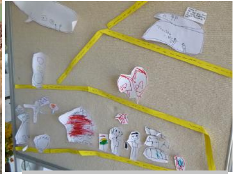
Mapping our world