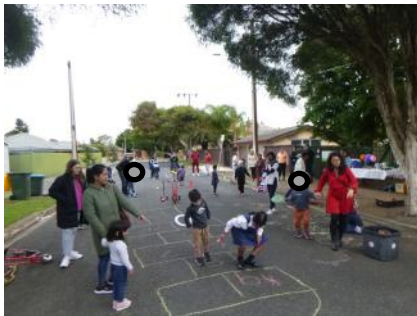
Street Play 2022