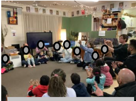
Twilight Kindy 2022