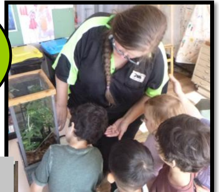
Our Incursion 'Bugs N Slugs'