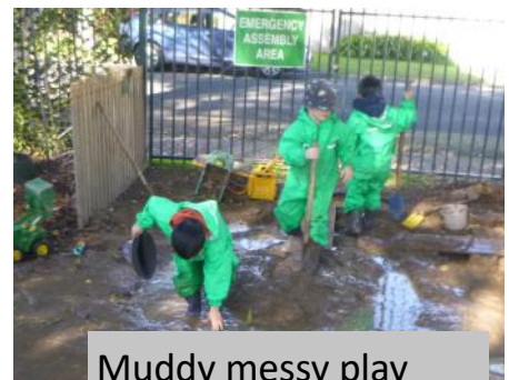
Muddy messy play