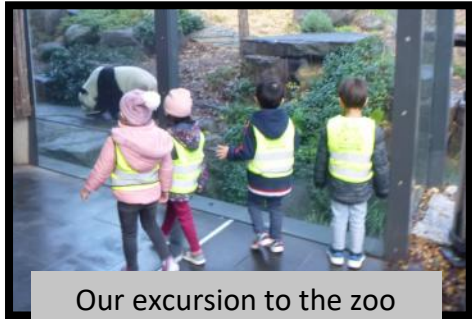
Our excursion to the zoo