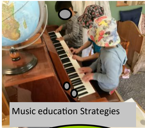
Music education Strategies